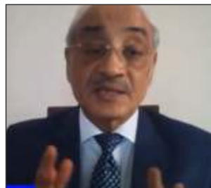
Hon'ble Mr Justice Swatanter Kumar Former Judge Supreme Court of India