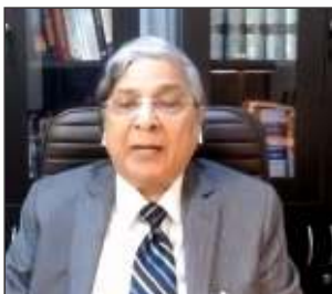
Hon'ble Mr. Justice Dipak Misra Former CJI