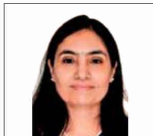
Hon'ble Ms. Justice Vaibhavi Nanavati Judge, High Court of Gujarat