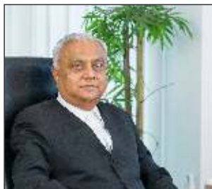
Shri Sudhir Nanavati Senior Advocate High Court of Gujarat