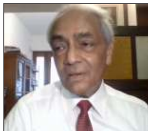
Hon'ble Mr. Justice Mohan Peiris Former Chief Justice, Supreme Court Srilanka