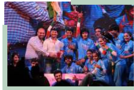
2nd Prize winners at AM talent Hunt