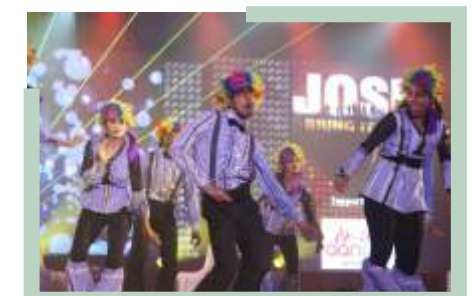
Winners at JOSH for 6th year in succession