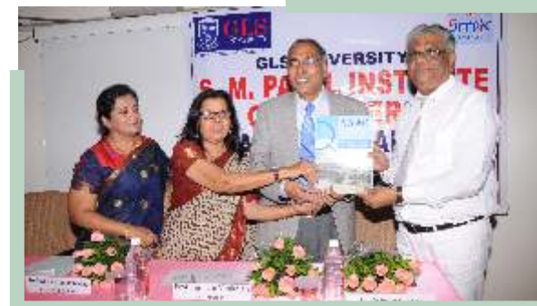
NAAC Peer Team Visit