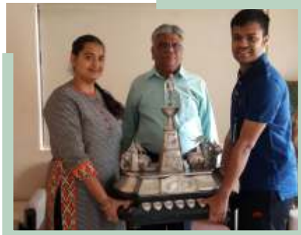
Winner of Mahatma Gandhi Elocution Competition