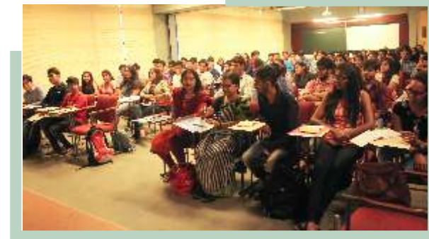
Workshop at AMA