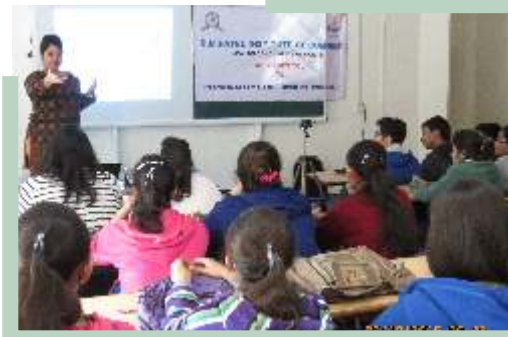
Personality Development Workshop