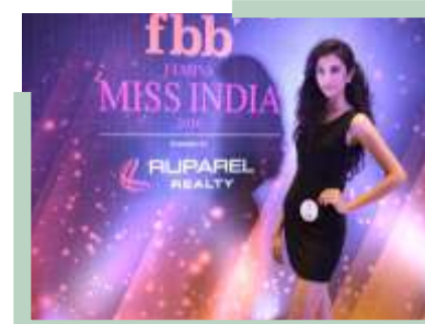
Femina Miss India Finalist