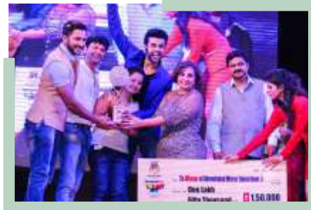
1st Prize winner at AM talent Hunt