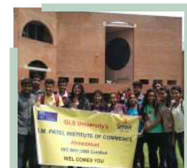
Educational Visit to IIM