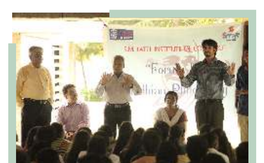
Forum of Gandhian Philosophy Visit to Gandhi Ashram