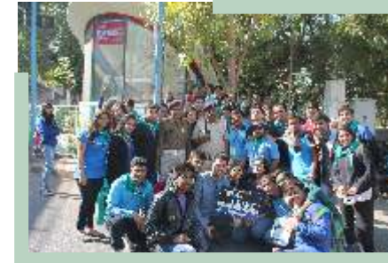
Traffic Awareness Drive