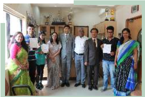
Winners & Judges of Manthan - An Inter-class Elocution Competition