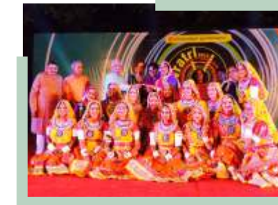
Winners At Navaratri Festival