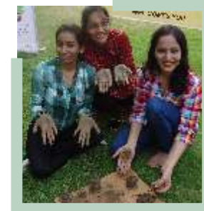
Go Green Ganesh - Campaign