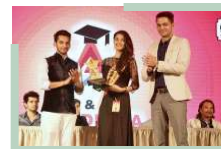
Ms. Academia 2015