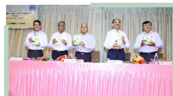
ISBN Book Publication