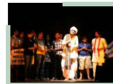
Winner of INT Drama Competition