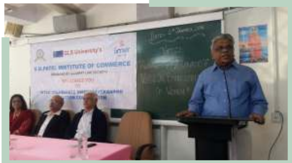
Inter collegiate Swami Vivekanand Elocution Competition