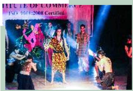
Facets- College Culfest