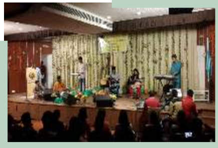
SMPIC Band In Symphony