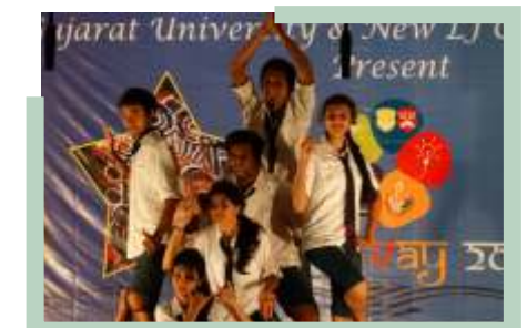
Winner of Skit Competition