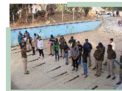
Rifle Shooting Training