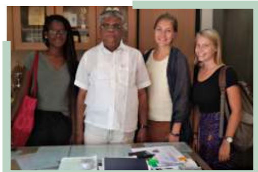
Visit of International Students at SMPIC