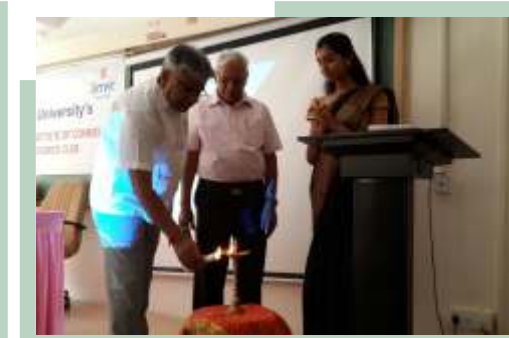
Inauguration of Economics Club